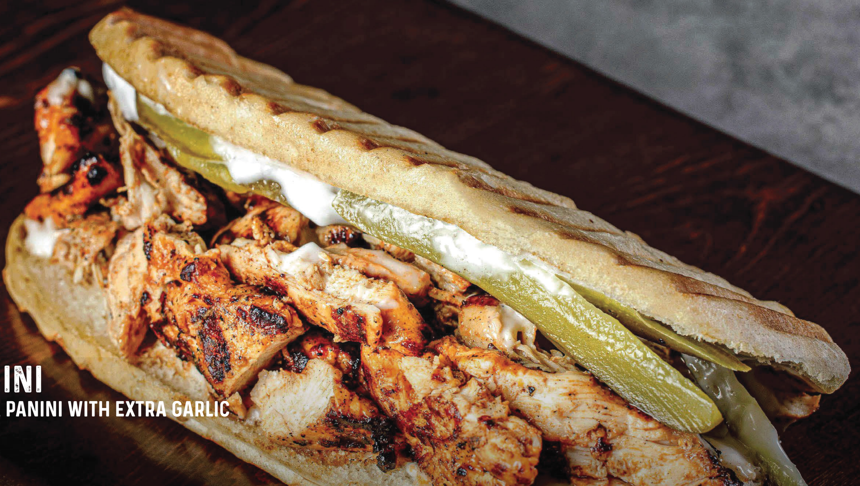
CHIKANINI CHICKEN IN A PANINI WITH EXTRA GARLIC