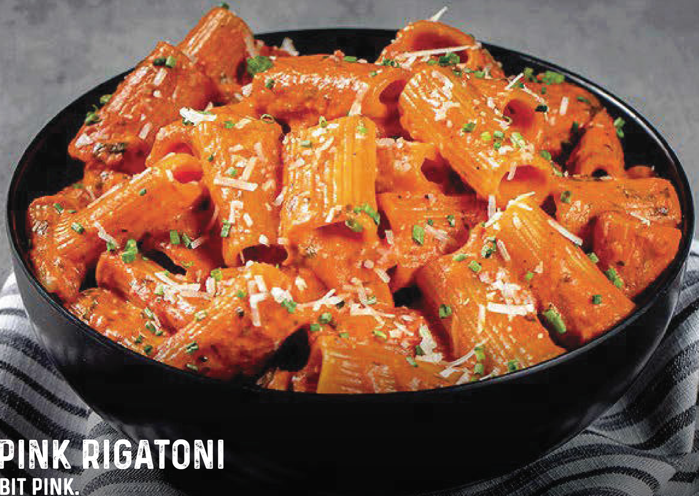
DRUNKEN PINK RIGATONI A BIT DRUNKEN, A BIT PINK.