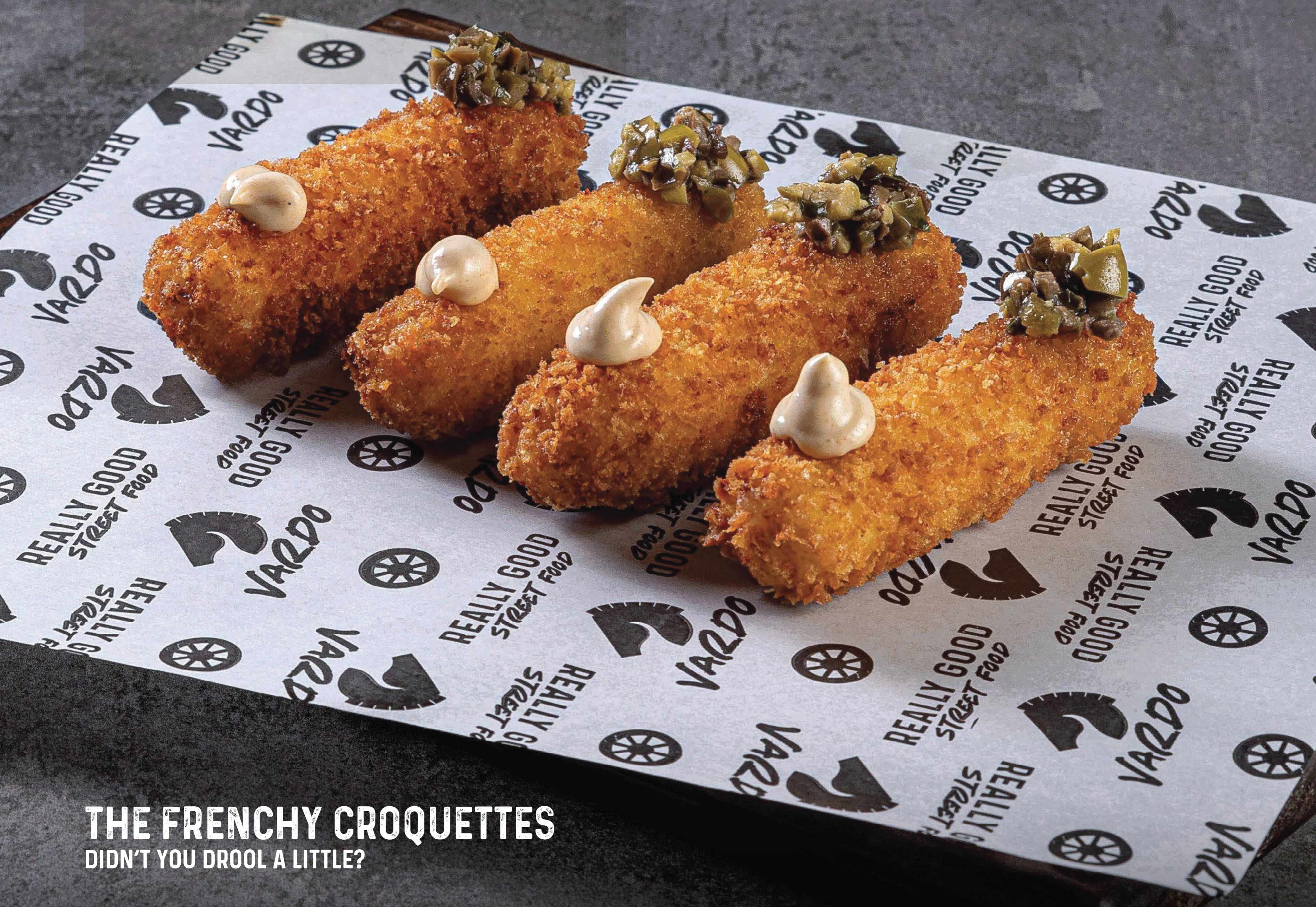
THE FRENCHY CROQUETTES DIDN'T YOU DROOL A LITTLE?

+ 1 CROQUETTE 1,5$ + 1 CHICKEN STRIPS 1,5$ + 1 FAHITA BALL 2$