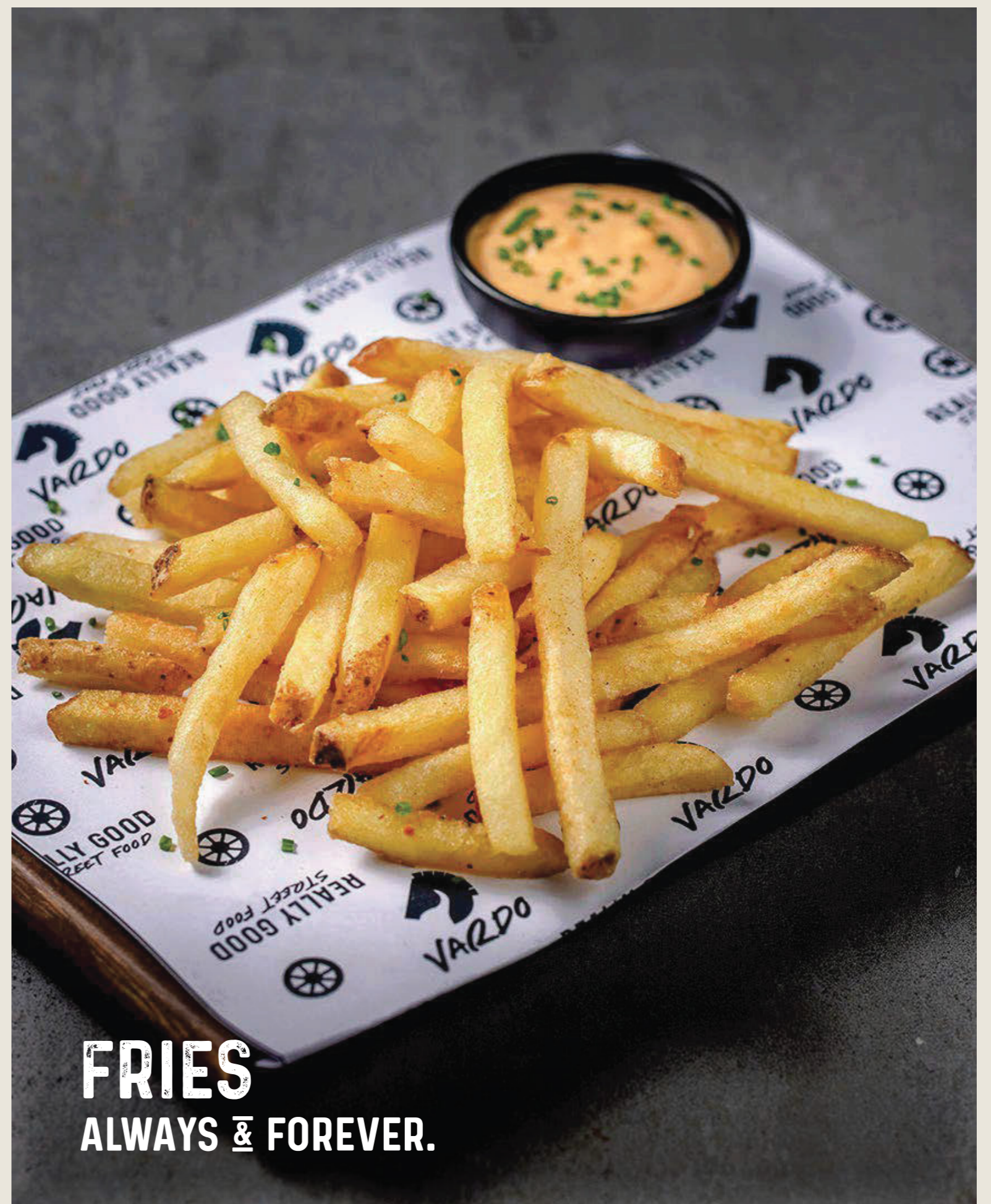
FRIES ALWAYS & FOREVER.